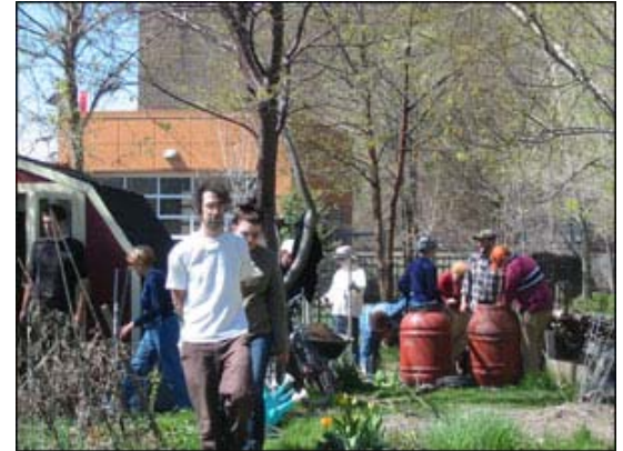
The Bytowne Urban Gardens (corner of Metcalfe and Catherine)

In 1999, BUGS started lobbying for more long-term security. "We made the argument that housing plus gardening